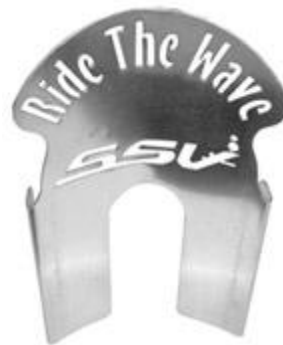
The Hands Free Attachment(how to use it)

Warning, using the HFA will scratch the inside of the SSV. Plastic boots are now here and come with your SSV. Slip them on the HFA to protect your SSV.