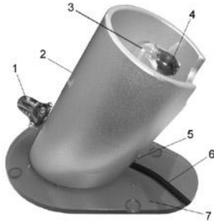
The One & Only Quick Change Wand

This is a perfect time to turn your Silver Surfer ON and READ this manual! You need to wait ten minutes for the oils from assembly to burn off the heater anyway!